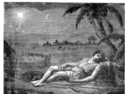
Joseph the Shepherd

The other brothers killed a goat and dipped Joseph's coat in its blood. They told their father that he had been killed by some wild animal. Jacob saw the coat and was heartbroken. All his family comforted him but he refused to be comforted.